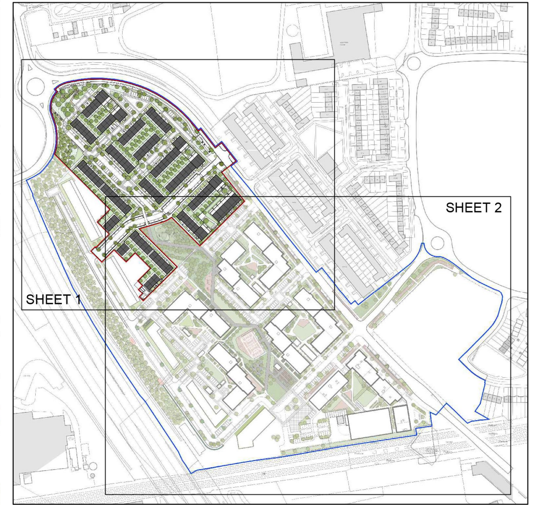
Keyplan Not to Scale

Please refer to Waterman Moylan Engineers' drawings and reports for all proposed road levels, drainage and attenuation details and other engineering works. Please refer to Mitchell & Associates Landscape Architects' drawings for surface finishes, landscaping details, planting details and specification, boundary details and all proposed levels and contours to public open spaces. This drawing is also to be read in conjunction with reports and drawings from the following consultants included with this application: Land Development Agency, DCC Housing, Van Dijk Architects, Waterman Moylan Engineers, Mitchell & Associates Landscape Architects, Tobin Consulting Engineers, KPMG Future Analytics (planning consultants), Sabre Electrical Services Ltd., Archer Heritage, AWW Consulting, Digital Dimensions, BRE, GNet 3D.